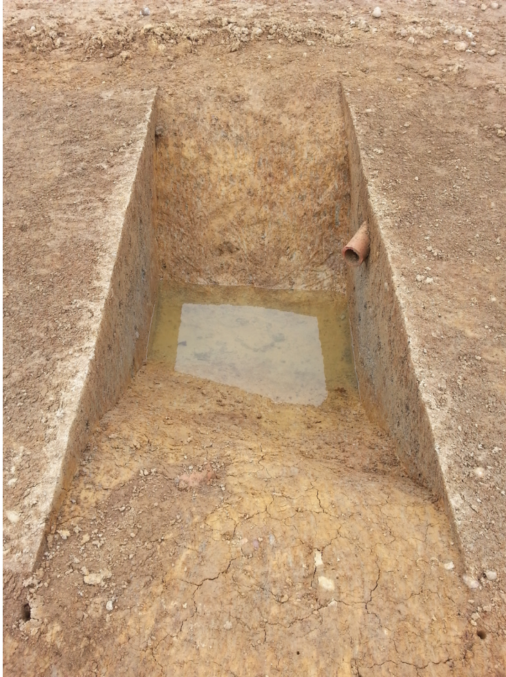
Fig. 3. A slot through the Bronze-Age enclosure ditch in Banbury.

to have cut a complex of prehistoric features. Later prehistoric ditches were found associated with field boundaries and enclosures, and a small number of Neolithic pits were recorded. A large Bronze-Age enclosure ditch, over 70 meters in diameter, was initially identified during the geophysical survey of the site (Fig. 3). The ditch enclosed a number of roundhouses and other features. A series of Neolithic pits were also recorded in the immediate vicinity. Archaeological features from this period have been traditionally very rare in this part of the county so this is a particularly interesting and significant excavation.