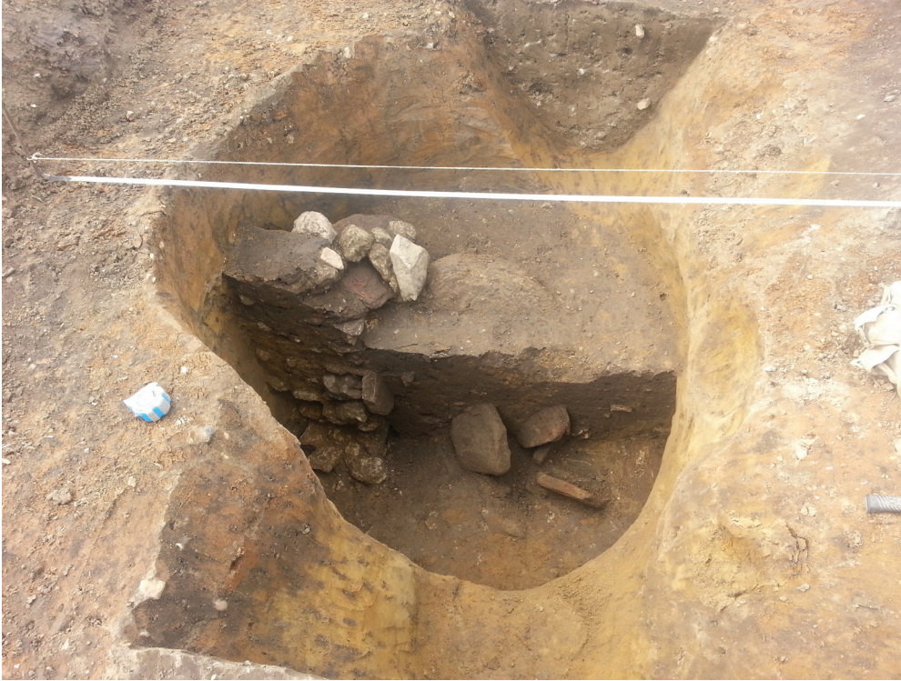
Fig. 2. A Roman well in Thame.

A subsequent excavation by Nexus Heritage is currently underway which has recorded a series of Iron-Age pits, enclosures and roundhouses, and a large number of Roman ditches and enclosures. A number of Saxon sunken-featured buildings have also been recorded.