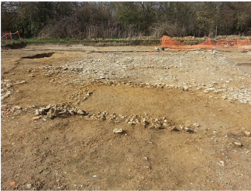
Fig. 1. Roman building foundations at Langford Lane.

An archaeological evaluation by JMHS on the north-west side of Thame recorded Iron-Age and Roman settlement along with inhumations from the Iron Age and Roman periods (Fig. 2).